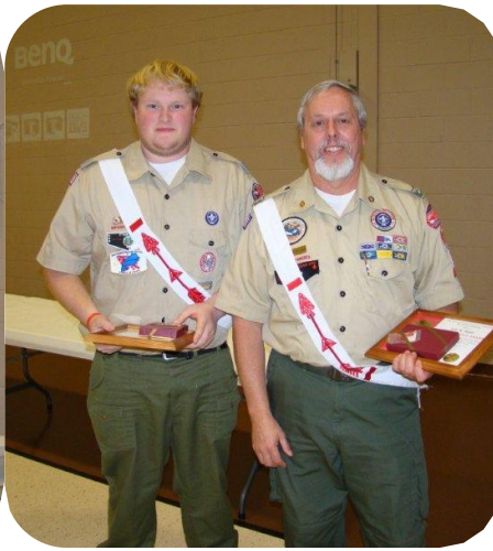
Founders Day Award Recipients: