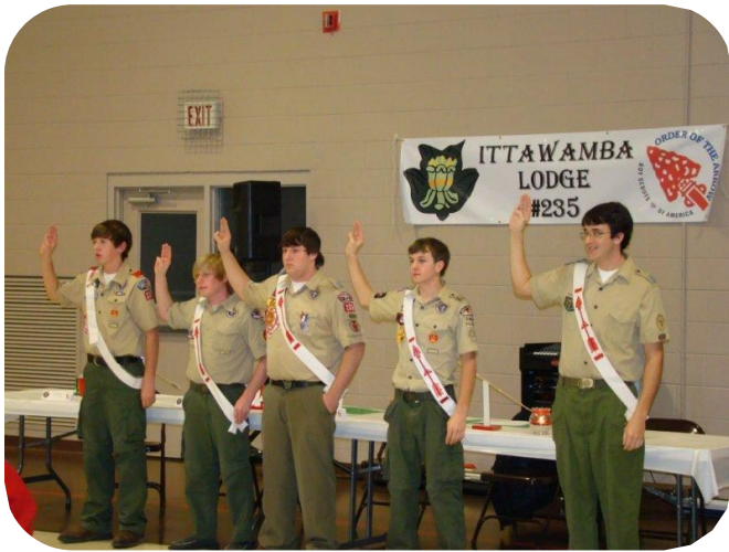
2011 Lodge Officers